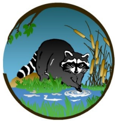
ERNIE MILLER NATURE CENTER

Spring Dates & Activity Number: 1/12 # 16582, 2/9 # 16583, 3/9 # 16584, 4/13 # 16585