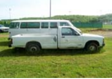
1990 Chevy Pick Up Does not run 60,650 miles