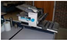
Pitney Bowes 1863