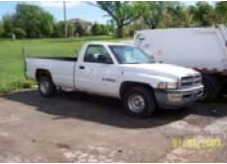
1999 Dodge Ram 1500 Needs new transmission 135,161 miles