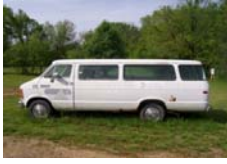
1988 Dodge Van Does not run 130,307 miles