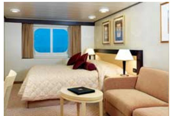
Example of a C2 Britannia Outside Stateroom