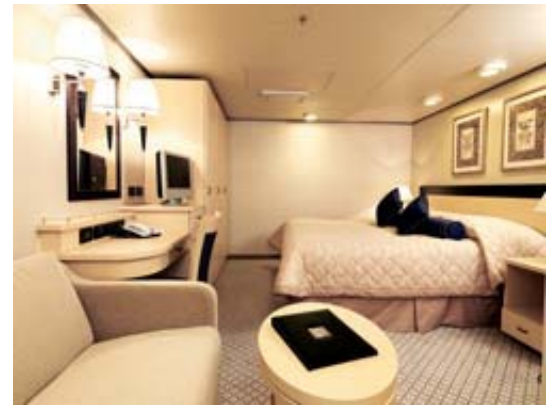
Example of a D1 Deluxe Inside Stateroom

Travel Insurance is provided by Travelex, and is based on the price of the cabin type selected.